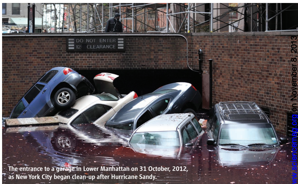
The entrance to a garage in Lower Manhattan on 31 October, 2012, as New York City began clean-up after Hurricane Sandy.

There are serious science gaps, however (5, 6). In many communities, decision-makers lack climate information or the means to apply it. In others, knowledge of current or potential future impacts exists, but not in a form or context that decision-makers can assimilate or act on in advance. In still