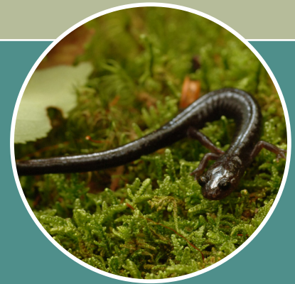
CHEAT MOUNTAIN SALAMANDER

The conservation community recognizes it is essential for natural resource management agencies, researchers, conservation organizations, and industries and communities to work together and understand the impacts of these stressors to determine how best to address the major environmental issues across large regions and jurisdictional boundaries. To that end, a Steering Committee composed of representatives from federal and state agencies, non-governmental organizations, Tribes, and key members of regional partnerships (such as Bird Joint Ventures and Fish Habitat Partnerships) guides fiscal oversight and strategic direction for the Cooperative. The Appalachian LCC works to connect efforts, identify gaps, and avoid duplication through